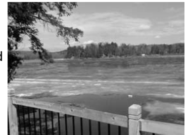
Some Ice On The Lake